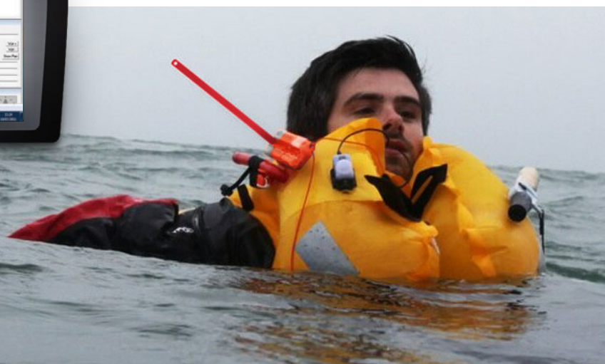
Image shown is Euronav Software