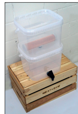
Buckets not included.