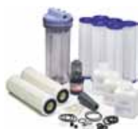
Preventative Maintenance Kit