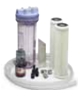
Silt Reduction Kit

For waters with high levels of suspended matter, e.g. in shallow anchorage, we would recommend you use an additional prefilter. This additional filter is finer (5 microns - 1 micron = 0.001 mm) than the standard filter (30 microns) and is placed after it. A booster water pump (12V/0.8 A/h) is also provided. This pump compensates for the loss through the second filter and increases water production. We would also recommend the prefilter kit when the PowerSurvivor is not installed under the water line and when it is in constant use to increase the intervals between servicing.